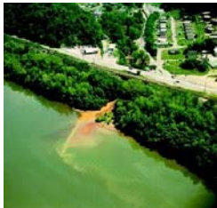
Sediment-laden runoff discharging into a river

To improve our water quality and stay in compliance with state and federal regulations, Hopkinsville has adopted an Erosion Prevention and Sediment Control (EPSC) Ordinance 37-2007. This ordinance regulates stormwater runoff from