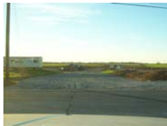
Proper construction entrance