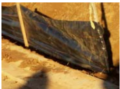
Silt fences should be properly trenched-in to prevent breaching