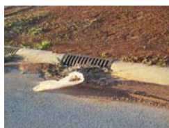
Sediment and construction trash should never reach a storm drain