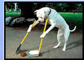
Clean up after your pet