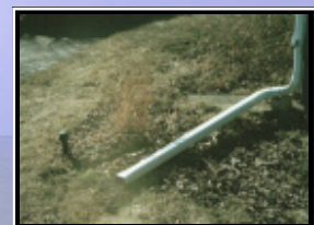
Direct downspouts away from paved surfaces