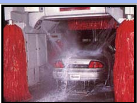
Wash the car at a car wash or on the grass