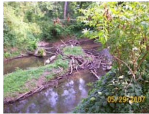
Before logjam removal

Please call the Surface and Stormwater Utility office at (270) 887-4035 to report a drainage problem, report a logjam in your area, or to report an erosion problem or illicit discharge. Please visit the Stormwater Utility website at www.hopkinsville-stormwater.com or go to the Hopkinsville-Christian County Planning Commission's Storm Water Management webpage at www.hoptown.org/agencies/planning-commission/storm-water-management for more information.