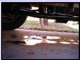
Check cars for oil leaks and recycle oil.