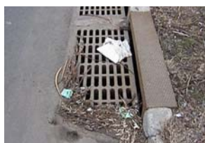
Litter and sediment entering storm drain

Storm drain inlets across Hopkinsville are being labeled with this colorful marker with a pollution prevention message. These labeled inlets are just a portion of our city's stormwater drains. Each inlet represents a potential point for pollution to enter our waterways every time it rains. Water which enters these inlets can contain pollutants such as motor oil, yard clippings, pet waste, trash, lawn chemicals and other debris or toxins.