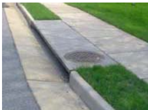
Labeled Stormwater drain "curb inlet"