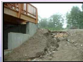
Prevent erosion. Fill in bare spots.