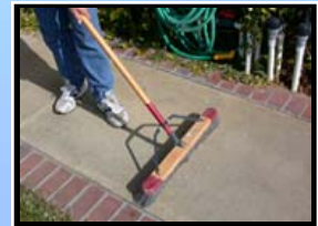
Sweep sidewalks and driveways instead of using the hose