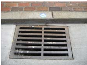
Labeled Stormwater drain "grated" (Farmers Market)