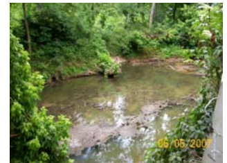
After logjam removal