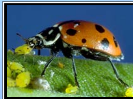
Avoid pesticides...learn about Integrated Pest Management