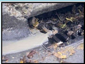
Never dump anything down storm drains (Ordinance 36-2007)